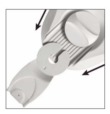
Speed-Lock<sup>™</sup> Mounting System Just slide the speaker onto the bracket until you hear the "click." The Speed-Lock Mounting System ensures easy, safe one-handed installations and no-slip setting of the speaker angle.